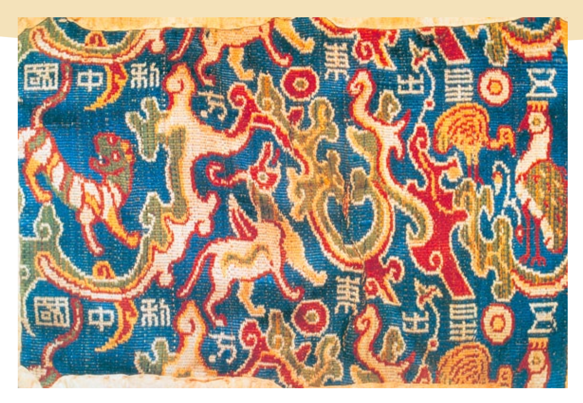
Wu xing chu dongfang li zhongguo 五星出東方利中國 – "If the five Planets rise in the East, this is beneficial to China": Characters embedded in omen design on the piece of brocade discussed, probably a bowman's arm guard, found at a tomb in Niya, Xinjiang, 1995.