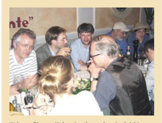
Welcome Dinner – Welcoming the newly arrived visiting fellows in spring 2011.