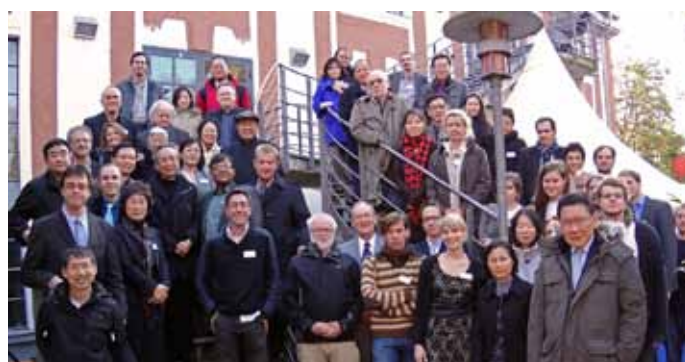
Participants and attendants of the conference.