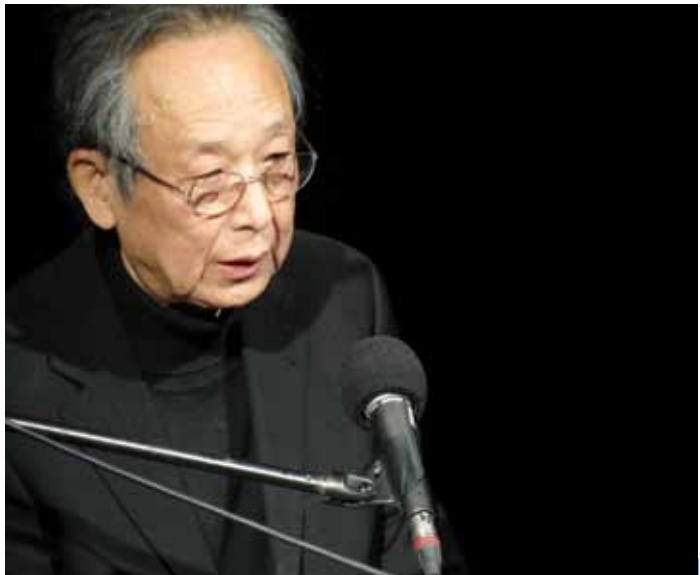
Gao Xingjian during his opening lecture.

This importance of freedom arises first and foremost from his biography: Gao Xingjian, born in 1940 in China, completed his degree in French literature in Beijing in 1962 and began working as a translator. He was sent to the countryside to be reformed through labor during the Cultural Revolution (1966-76) and was forced to burn all of his manuscripts. Nevertheless, Gao continued writing and succeeded in publishing some essays, short novels, and plays in Chinese maga-