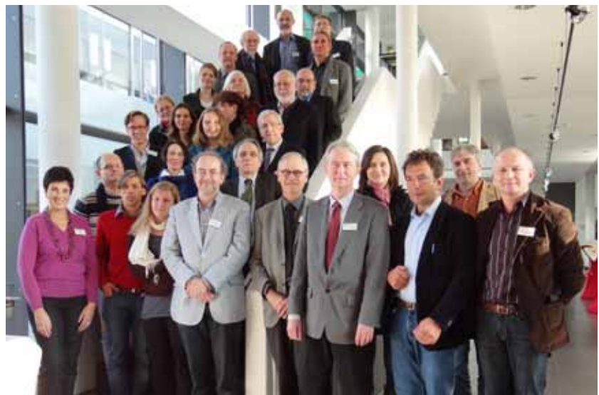
The participants of the conference at the venue, the Medical Valley Center (ZMPT), Erlangen University