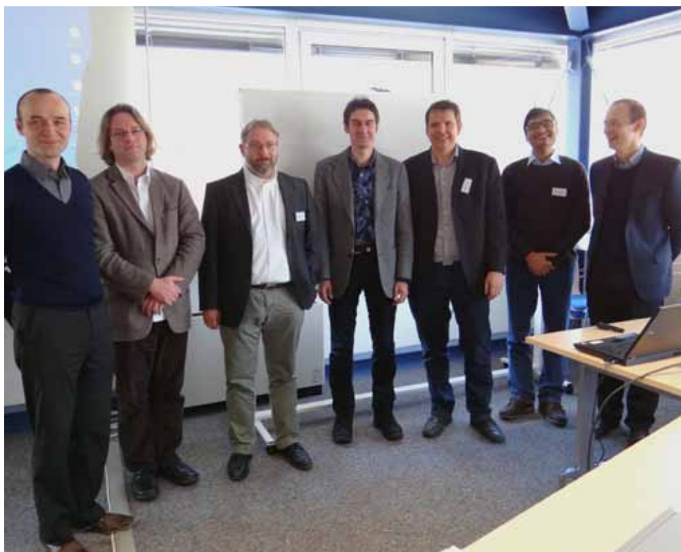
Participants of the workshop that dealt with “Fate, Freedom and Prognostication in Indian Traditions.”

In addition to the main story – a feud between two branches of a royal family that culminates in a gigantic, destructive battle – the epic contains large philosophical passages and numerous episodes, which are inserted at different points, often in order to expand or explain the main narra-