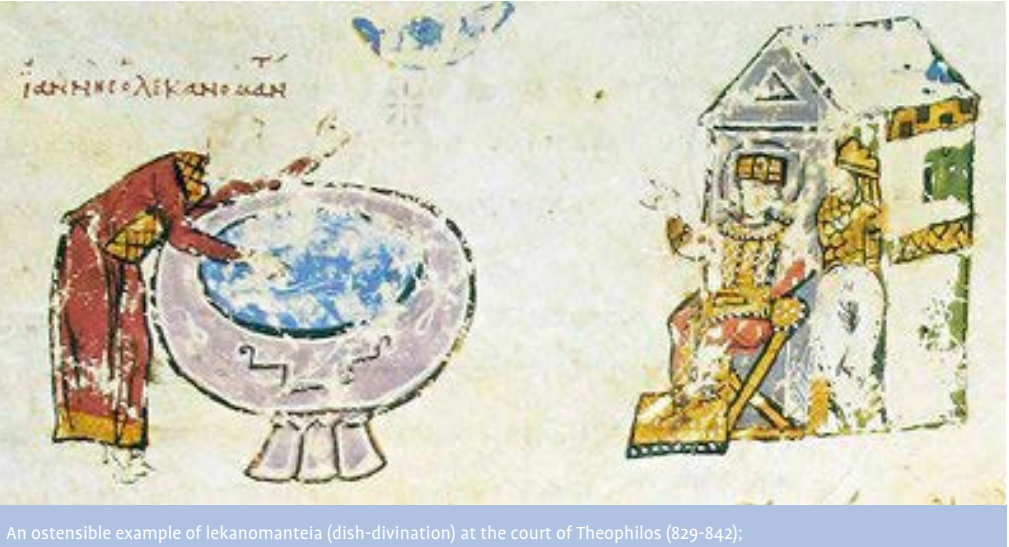
n ostensible example of lekanomanteia (dish-divination) at the court of Theophilos (829-842); hoto: Wikipedia copyright: https://commons.wikimedia.org/wiki/File:John_VII_of_Constantino

The Byzantine emperor relied on two kinds of hu-