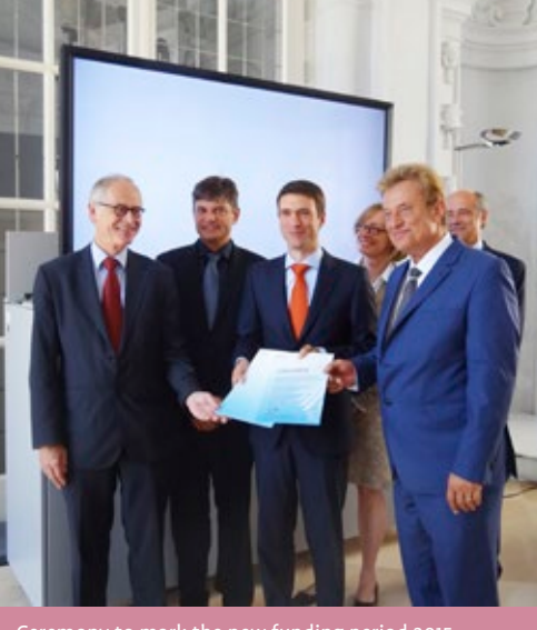
Ceremony to mark the new funding period 2015

a position to evaluate the ethical dimension of any kind of forecasting in the crucial moment of its verification. I am increasingly convinced of the need for a research institution dealing with "Critical studies on Prognostication" to be established on a permanent basis.