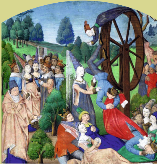
On the Fates of Famous Men Wheel of Fortuna in an illustration from Vol. 1 of Boccaccio's "De Casibus Virorum Illustrium" (Paris, 1467)